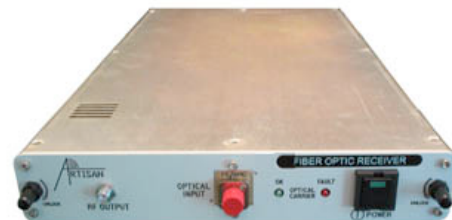
Front view: Optical receiver